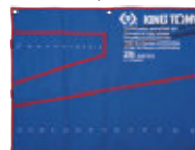
► MR / SR : Nylon pouch bag