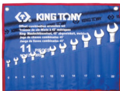
► MRN / SRN : Tetoron pouch bag